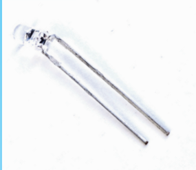
SP38.01 LOOSE L.E.D. CUT AND LEFT BEND